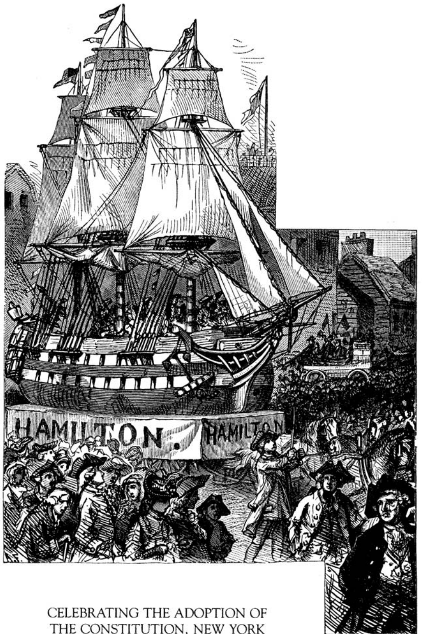
CELEBRATING THE ADOPTION OF THE CONSTITUTION, NEW YORK

“It was the first of many more tumultuous parades down Broadway under the new government. Later, they would add ‘ticker tape’ to celebrate peace, victory, and --- sweetest of all --- liberty”. (Source: William J Bennett, America The Last Best Hope, Vol I, p 132.