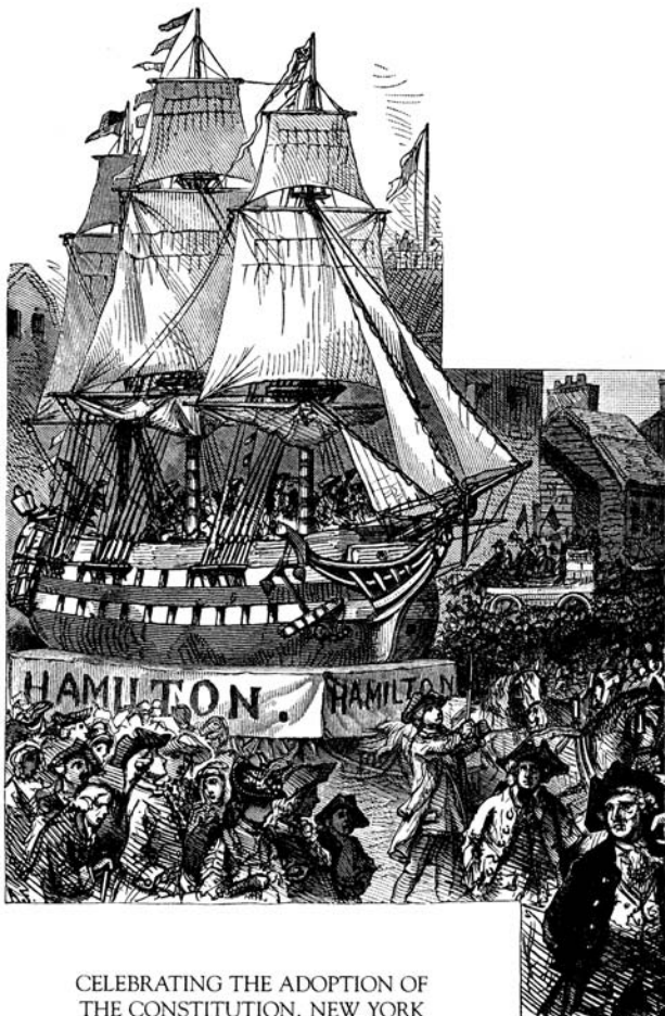
CELEBRATING THE ADOPTION OF THE CONSTITUTION, NEW YORK

The John Lyon Gazette: Winner of 1999, 2003, 2004 and 2007 Clair B. Poff Public Relations Award for Outstanding Newsletter, and Winner of Second Place Award for 2000, 2001 Ladies Auxiliary Award: Best Newsletter in Virginia, 1999, 2001, 2003, 2004, and 2006; Best Newsletter in the Nation, 1999, Second Place 2006