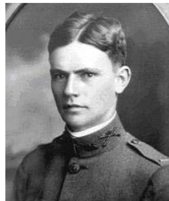
Lt John Lyon 2 April 1893 – 16 October 1918

For more information on The National Museum of the United States Army , including how you can help, go to www.armyhistory.org or see information in the post home. (Excerpted from Press Release)