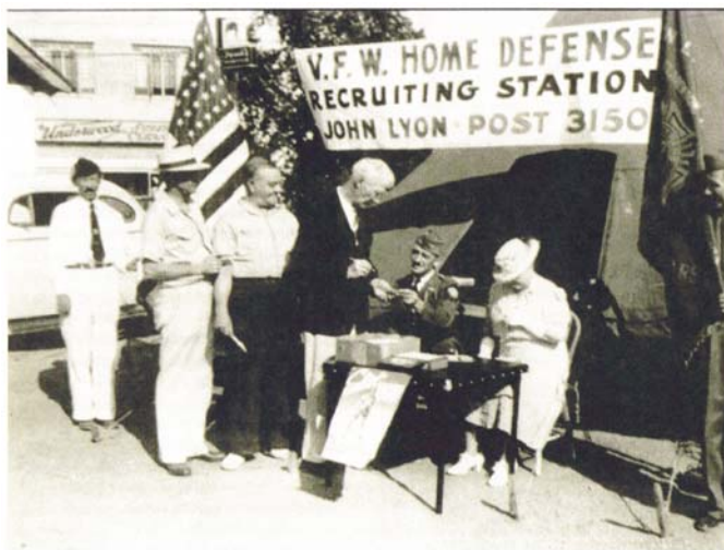
The earliest known photo of John Lyon Post 3150 in action is of this Home Defense Recruiting Station from 1941.