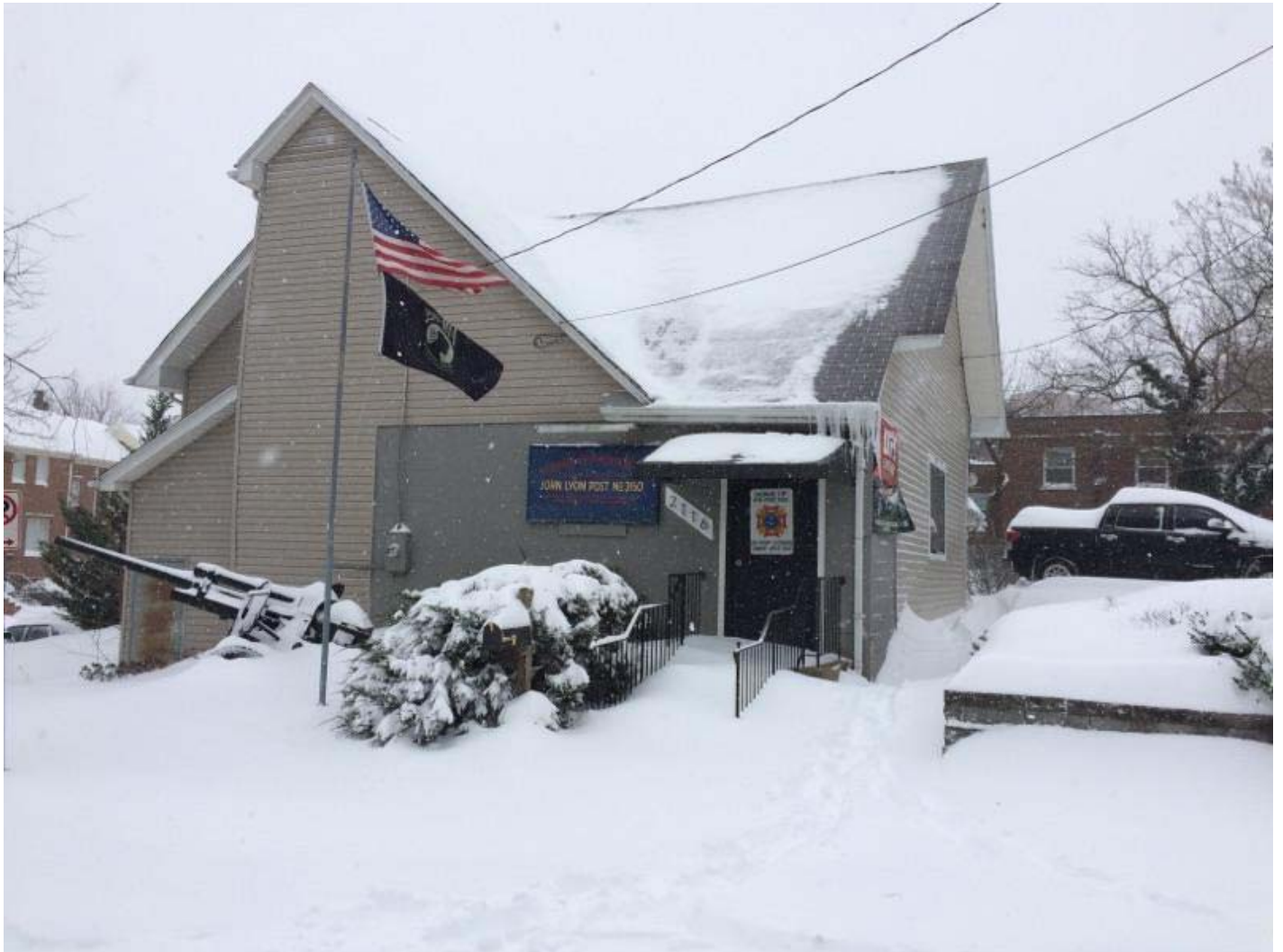
Post 3150 in Winter Storm Jonas, 22 – 23 January 2016 (thanks to Alex Nobles)