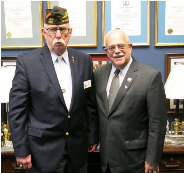
Post member C.D. "Doc" Crouch, National Legislative Committee member, meets with Representative Gerry Connolly (D-VA 11th District)

The National Legislative Conference, held in Washington DC, enables VFW and Auxiliary members to meet with members of Congress and present the VFW Legislative goals to their Representative and Senators. The VFW CINC also testifies before Congress. Post 3150 members joined in the week's activities.