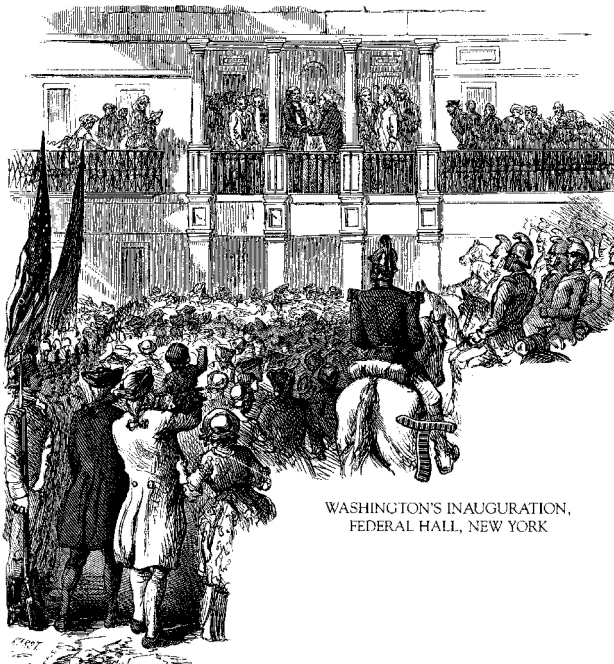
WASHINGTON'S INAUGURATION, FEDERAL HALL, NEW YORK