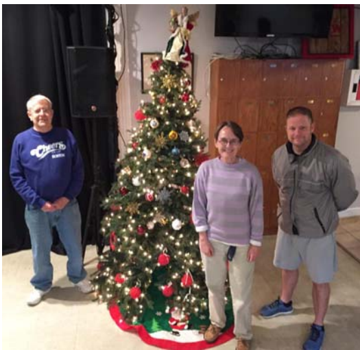
2021 Post Christmas tree

Merry Christmas, Happy Hanukkah and Kwanzaa and a Happy New Year!