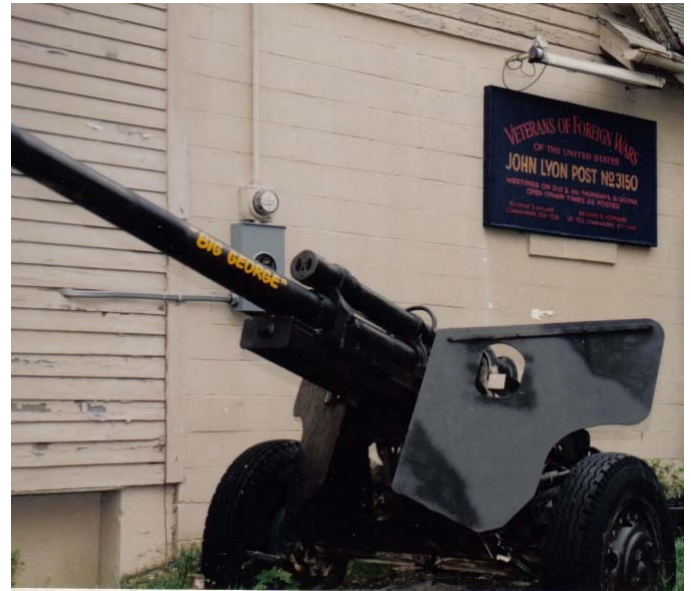
“Big George” (1991)